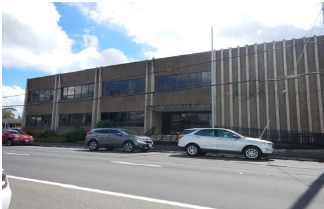
The North Coast Regional Water Board Northern Field Office (NFO) located at 930 6 th Street, Eureka.

The North Coast Regional Water Board Northern Field Office (NFO) is estimated to open on April 22, 2019, located at 930 6 th Street, Eureka, Humboldt County, California.