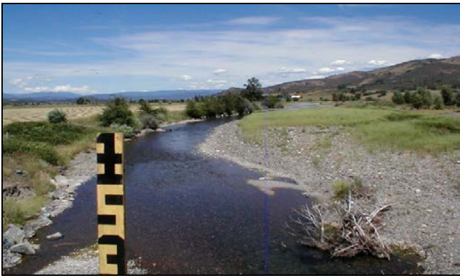
Figure 1 - Scott River at Fay Lane Bridge , looking downstream, July 17, 2000