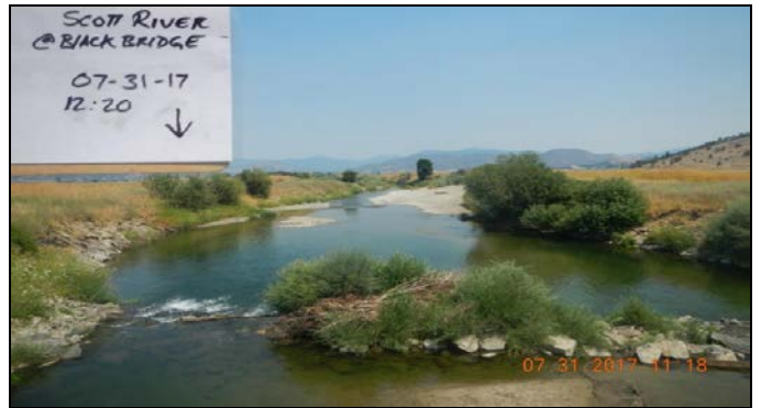
Figure 4 - Scott River at Eller Lane Bridge , looking downstream, July 31, 2017