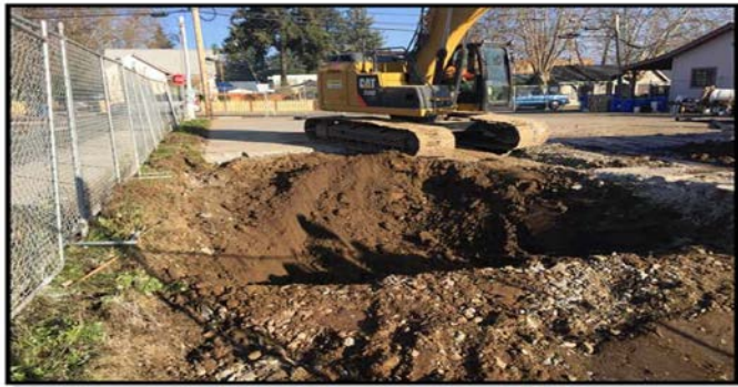
Source area excavation at Former Redwood Empire Cleaners.

adjacent rural residence. The Anderson Valley Unified School District exhausted the $1.5 million provided by the USTCF while significant soil and groundwater impacts remained at the site. Groundwater represents the sole source of water supply at the site and vicinity and water supply wells had previously been impacted by the release(s). SCAP funding is being used to complete the soil and groundwater investigation and protect the existing groundwater resource.