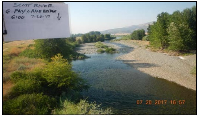
Figure 2 - Scott River at Fay Lane Bridge , looking downstream, July 28, 2017