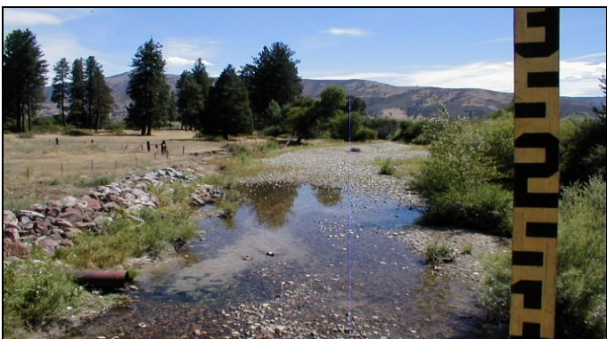
Figure 7 - French Creek at Highway 3 Bridge looking downstream, July 17, 2000