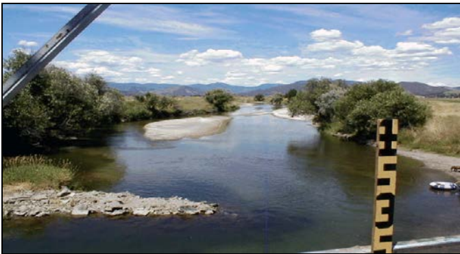
Figure 3 - Scott River at Eller Lane Bridge , looking downstream, July 17, 2000