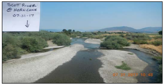
Figure 6 - Scott River at Horn Lane Bridge , looking downstream, July 31, 2017