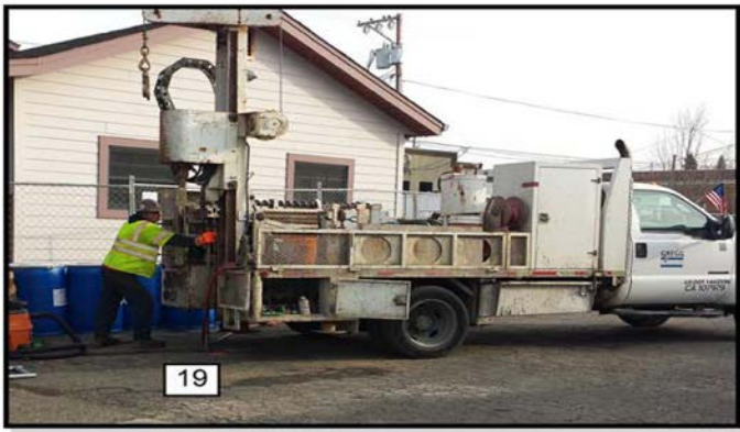
Remedial injection at Former Redwood Empire Cleaners.