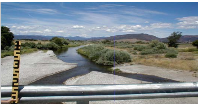
Figure 5 - Scott River at Horn Lane Bridge , looking downstream, July 17, 2000